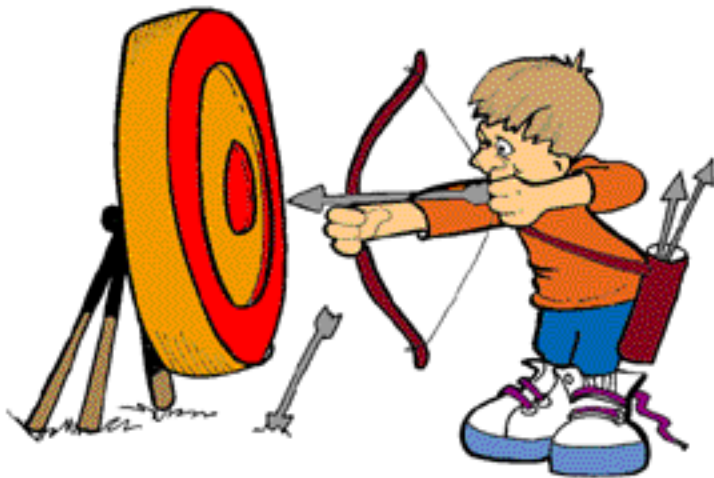
"Looks like another perfect score."