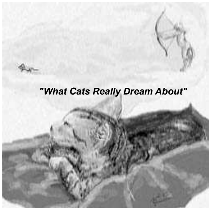
"What Cats Really Dream About"

"I used to have a handle on life, but it broke."